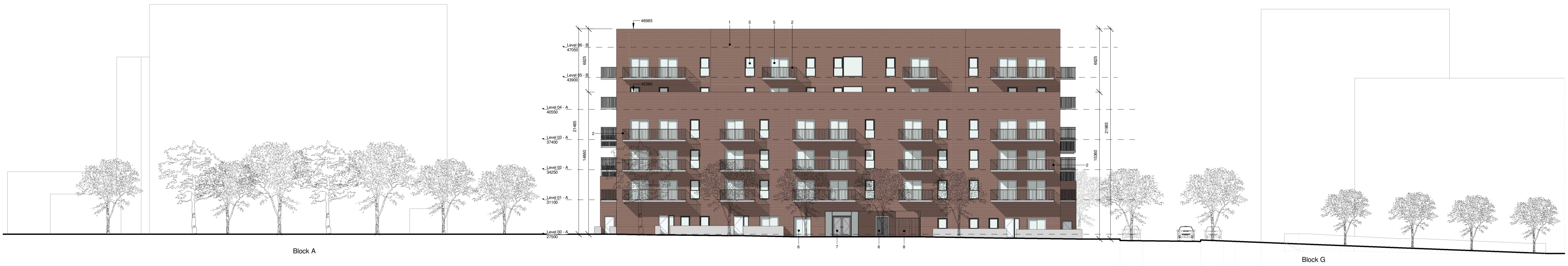
2 Block E - Elevation West 1 : 200