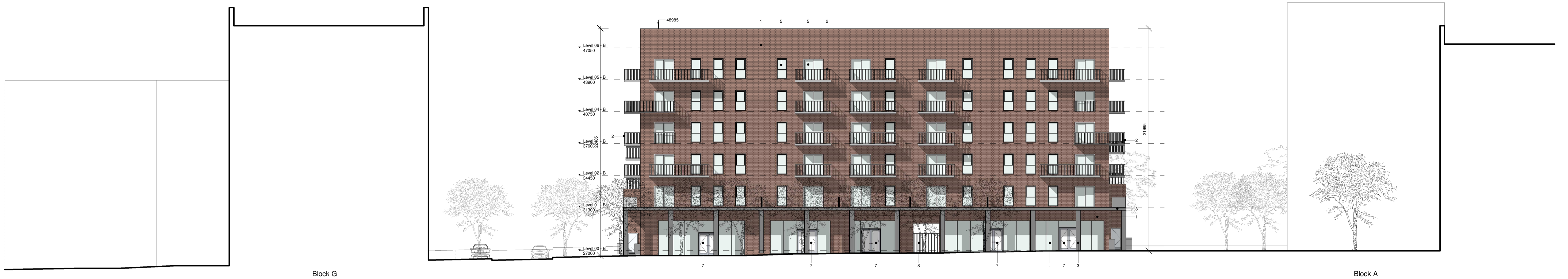
1 Block E - Elevation East 1 : 200